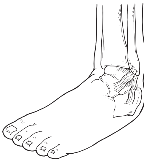
Injured ankle with laxity of ligaments

Chronic ankle instability usually develops following an ankle sprain that has not adequately healed or was not rehabilitated completely. When you sprain your ankle, the connective tissues (ligaments) are stretched or torn. The ability to balance is often affected. Proper rehabilitation is needed to strengthen the muscles around the ankle and “retrain” the tissues within the ankle that affect balance. Failure to do so may result in repeated ankle sprains.